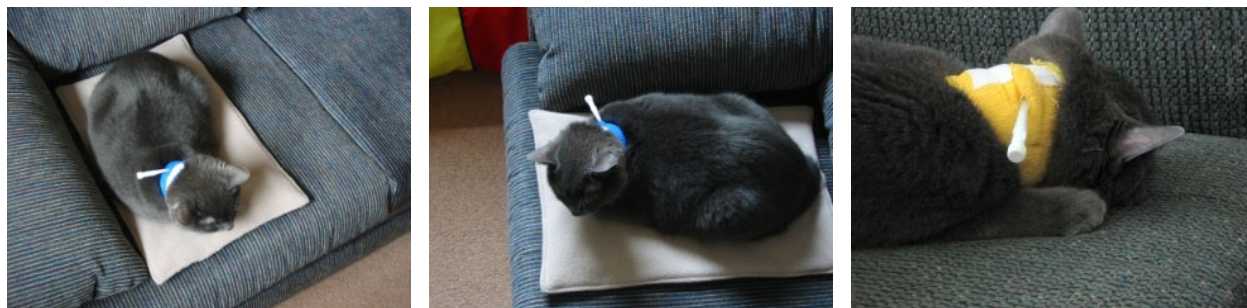
“Bear” with feeding tube into his neck (esophagostomy).

Assisted feeding is somewhat tricky. If the liquid diet is not working out, canned foods can be spoon fed or even formed into small “meatballs” and force fed in the same way that pills are administered. For some pets the struggling involved with force-feeding either by syringe or meatball method is simply too stressful. For these pets a feeding tube is needed to deliver the food.