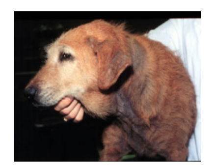
Note the "elephant skin" appearance that is especially common with Malassezia dermatitis. The more scientific term for this finding is "lichenification."