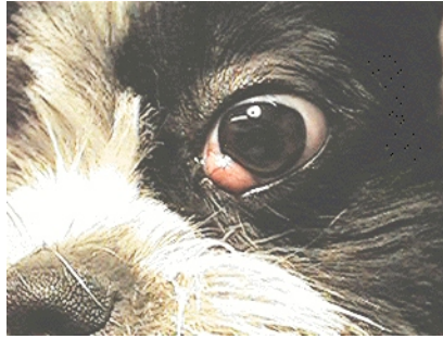
A dog with Cherry Eye.